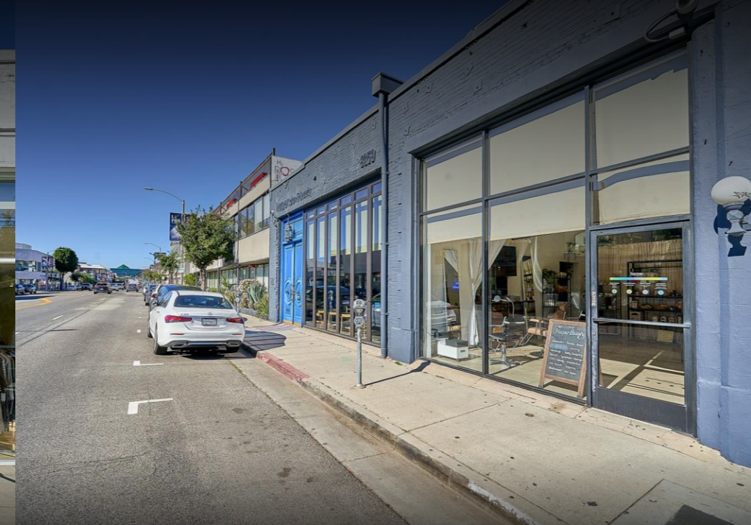
Turnkey Retail and Wellness Space