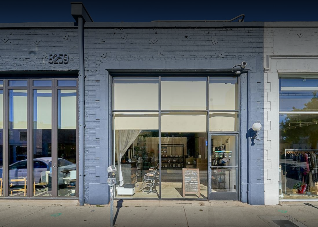
8257 Melrose Avenue

Well suited for beauty, wellness, skincare, massage, or boutique retail concepts, 8257 Melrose places tenants in a destination environment that attracts both local clientele and visitors. This is a rare opportunity for a brand seeking visibility, functionality, and a move-in-ready presence on Melrose Avenue.