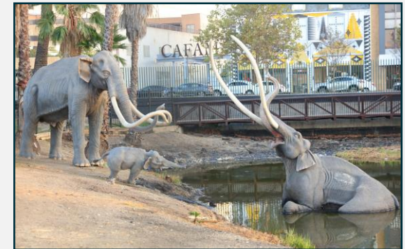
LA BREA TARPITS