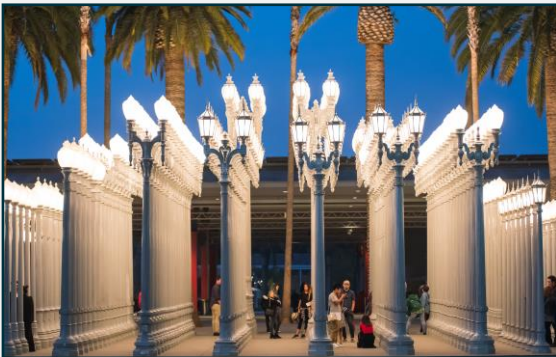
LOS ANGELES MUSEUM OF ART