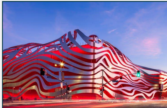
PETERSEN AUTOMOTIVE MUSEUM