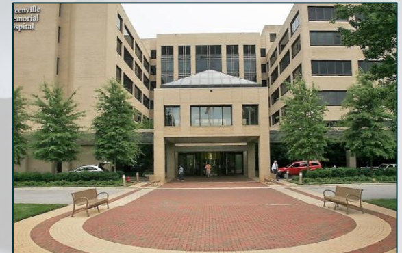
GREENVILLE HEALTH SYSTEM